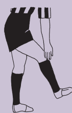
ILLEGAL BALL OFF BODY