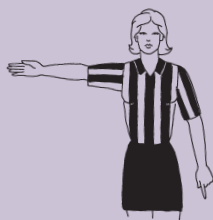
GOAL CIRCLE FOUL