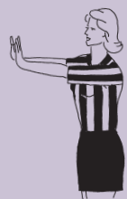
PUSHING OR BODY CONTACT